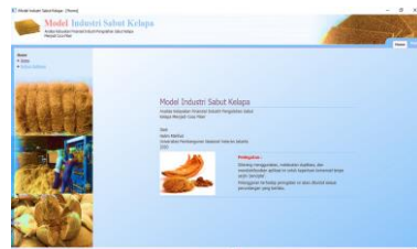
Figure 3. Front view of the Decision Support System for the Coconut Coir Processing Industry

The results of the design of the SPK-Coconut Coir Industry Model consist of three main components, namely the model base management system, the database management system, and the dialogue management system. The front view of the SPK-Coconut Coir Industry Model is presented in Figure 3.