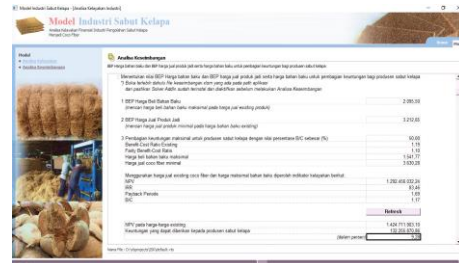
Figure 6. Continuous Value Added Search Model

Verification of the model based on the assumption of input data parameter values from coconut plantations and coconut coir processing factories produces a balanced price between the selling price of coco fibre and the purchase price of coco coir raw materials. At the selling price of coco fibre Rp.3.630/kg, the balance of the selling price of coco fibre is reached at Rp. 1.542/kg. The continuous value-added search process is shown in Figure 6 below.